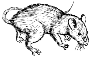
Figure 2. Rattus rattus Roof Rat