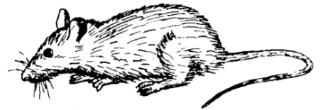
Figure 3. Mus musculus House Mouse

Diagrams of Rodents from Oklahoma State University Extension