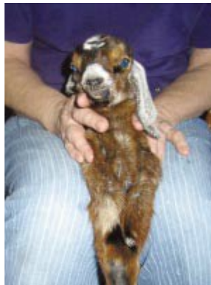
Holding a kid for tubing.