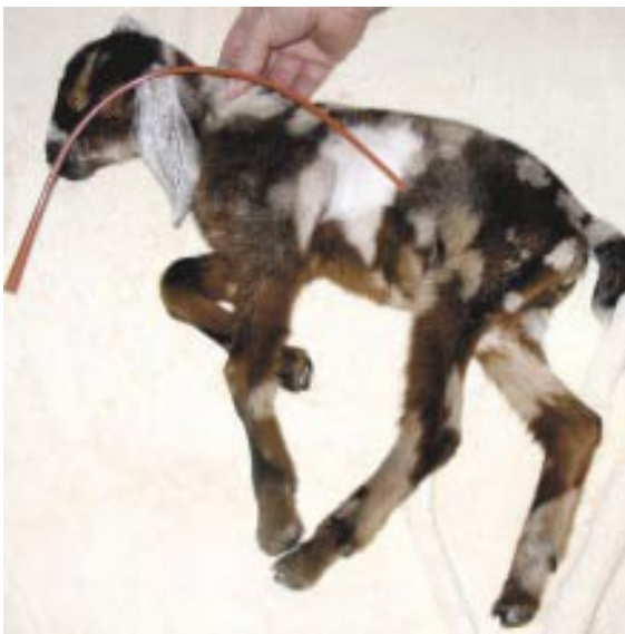
Positioning the tube for marking.