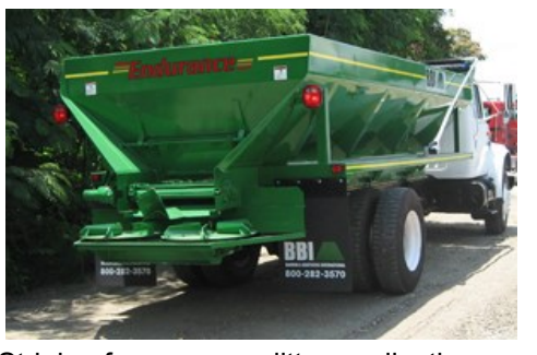
Striping from uneven litter application